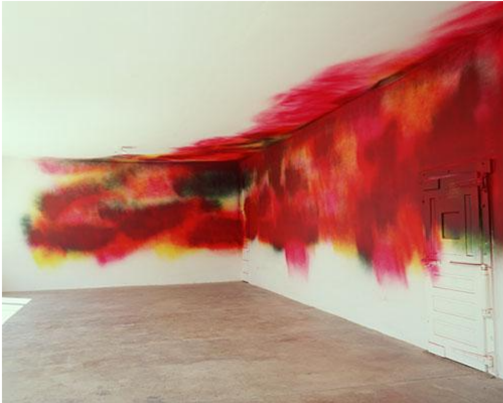
Artwork: Katharina Grosse

Using a variety of traditional and non-traditional materials, the workshop combines knowledge of the formal language of art with various chance effects. Several processes such as sifting, scraping, spilling and smearing will be used in the creation of an art work. These processes are important in releasing creative block conditions and inhibition, as well as to build confidence and rediscover freedom of expression. Instead of creating images we will excavate images.