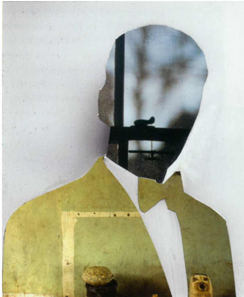
Artwork: Melinda Gibson

This workshop introduces artists to the place of texture in contemporary art. Various ways of creating texture and their embedded associations are explored. Heightened sensory perception is an objective in order to develop more acute sensitivity for expressive surface.