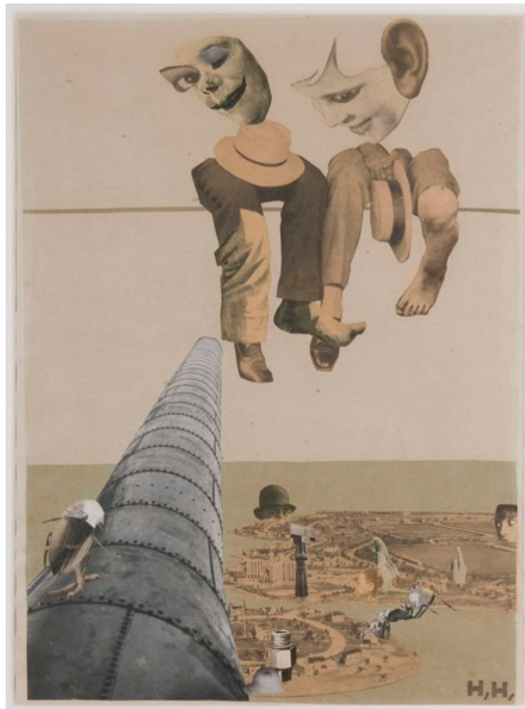
Artwork: Hannah Höch

This workshop is theory and crit based. It entails both looking at the back-to-basics of art, that is, revisiting the fundamental formal language of art, and methodologies of breaking the 'rules'. It will assist artists to understand when and why a work is considered as 'good' or successful, even when all the 'rules' have been broken. There is emphasis on when and why an idea or concept 'works'.